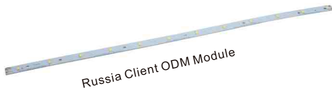
Russia Client ODM Module